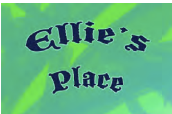
Type with Outer Glow