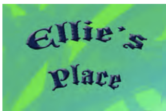
Type with Inner Bevel