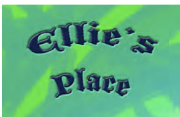
Type with Pillow Emboss