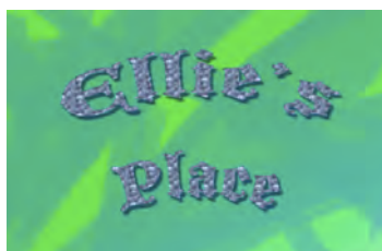
Type with Pattern Overlay & Drop Shadow