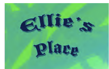
Type with Outer Stroke & Drop Shadow