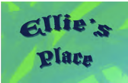
2. Type with Drop Shadow

Here in image 1 & 2, you can see the drop shadow option has been added to the type to make it stand out and attract attention