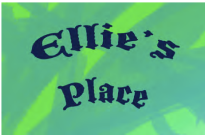
1. Original Type

Here in image 1 & 2, you can see the drop shadow option has been added to the type to make it stand out and attract attention